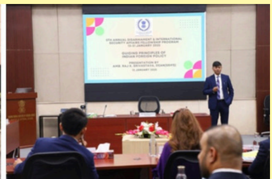
Welcome & Inaugural Session for D&ISA Fellows