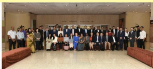
STUDY VISITS IN DELHI, BENGALURU & MUMBAI